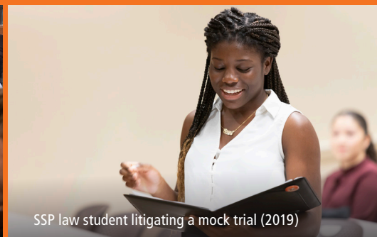
SSP law student litigating a mock trial (2019)