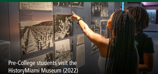
Pre-College students visit the HistoryMiami Museum (2022)