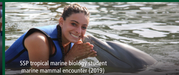
SSP tropical marine biology student marine mammal encounter (2019)