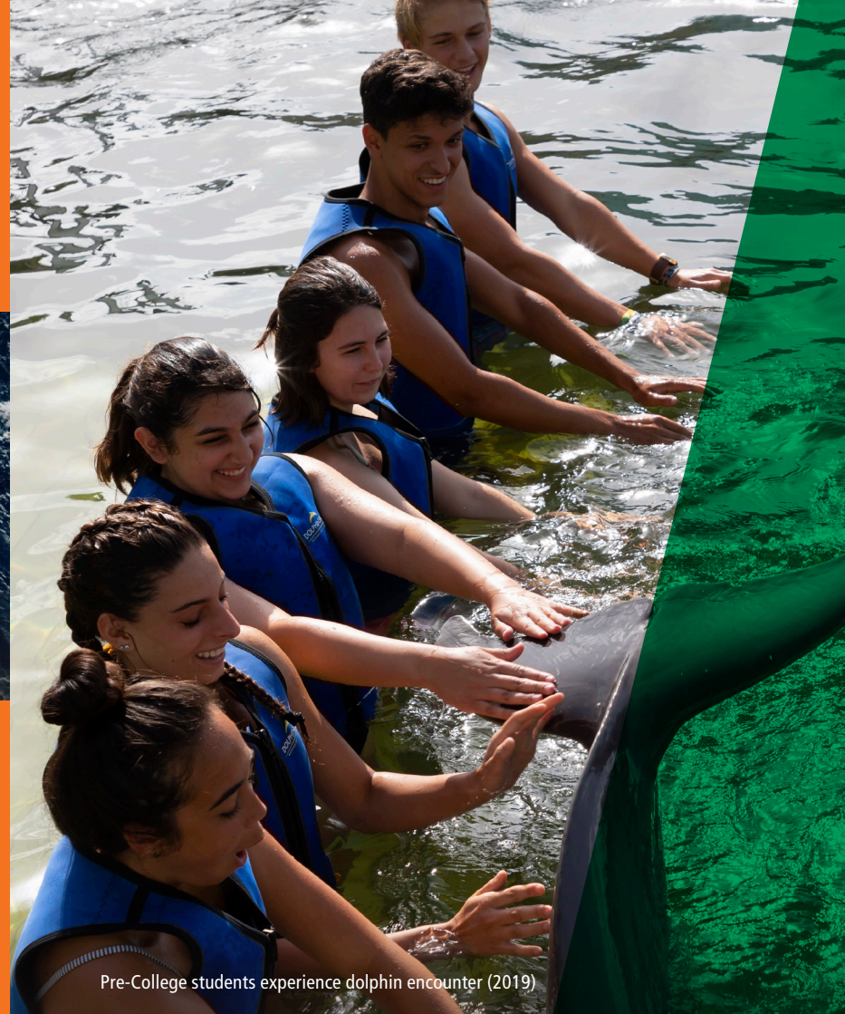
Pre-College students experience dolphin encounter (2019)