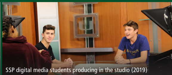
SSP digital media students producing in the studio (2019)